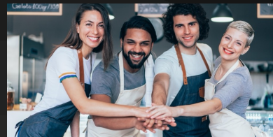
CREATING LONG TERM SUSTAINABLE GROWTH