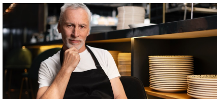
ACQUIRING FOUNDER-LED MULTI-UNIT BUSINESSES